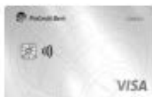
Classic — No fee