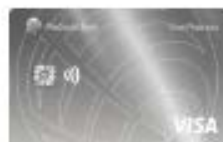
Platinum — UAH 300