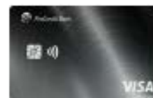
Infinite — UAH 1,500